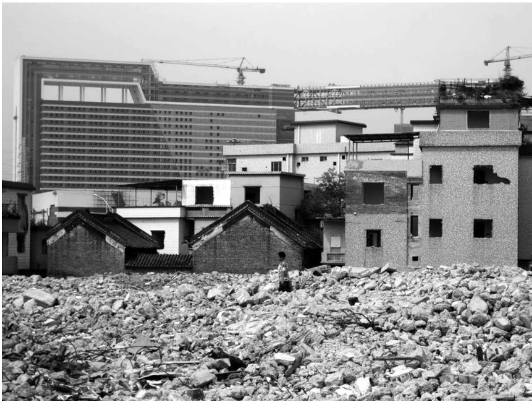
Figure 2: Flattened former rural village in Guangzhou (Photograph by Hyun Bang Shin, 2010)

movements, it still remains an important conceptual framework in China's urbanisation, as the country sees the significant position of the secondary circuit of accumulation heavily controlled and manipulated by the state and capital 8 . In this process of urban accumulation, urban spaces, old and new, increasingly embody the rapidly exacerbating inequalities in society. While the fruits of accumulation benefit the top officials, overseas investors and domestic industrialists as well as the emerging middle class populace, the masses—including rural villagers—experience dispossession of their lands as local governments carry out land-grabbing to put this land into industrial and commercial use. Homes are flattened as part of land assembled to make ways for more lucrative sources of revenue for local governments, who also aspire to promote 'world-city' landscapes. Workers, most of whom consist of migrants from rural hinterlands, face harsh working environments, poor job securities and suppressed wages. Affluence rises in major cities as centres of accumulation, but the pace of wealth accumulation alienates those who produce it.