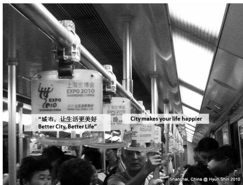
Figure 1: The slogans of the 2010 Shanghai World Expo

China's urban revolution comes with large-scale population sorting and displacement. Existing major mega-cities like Beijing and Shanghai go through the redevelopment of its inner-city cores as part of their attempts to convert the space into a higher and better use and transform the cities into 'world cities': this endeavour involves the attraction of particular types of urbanites (highly skilled professionals and expats) and the displacement of low-skilled workers and low-end service industries. One of the two inner-city districts, which accommodate the new CBD was announcing in 2012 that it would aim to displace 100,000 residents from the district by 2015, with the long-term goal of 30% population reduction in the next 30 years (Jin, 2012 2 ). The aim was to transform the urban space to attract highly skilled migrant workers including expats and to rid of low-skilled workers and the poor who do not conform to the 'world-class' urban image.